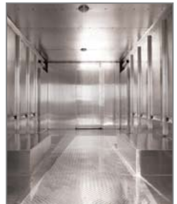
Standard cargo area with smooth aluminum plank floor, aluminum roof liner and optional aluminum diamond-plate overlay and bulkhead separating cab and cargo area