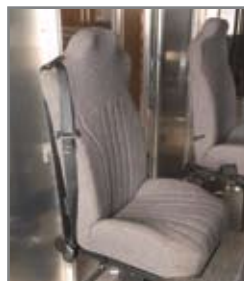
Right side passenger seat