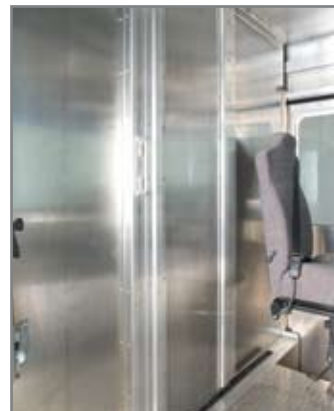
Aluminum bulkhead with center sliding door