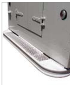
8" or 12" deep aluminum or steel bumper, available with Bustin insert or treadplate