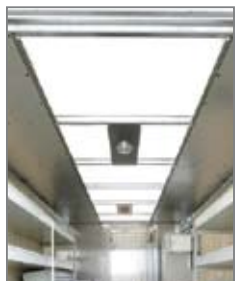
Translucent roof w/30" strip down center aisle or full width