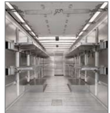
24" deep aluminum shelves (fixed or bottom folding)