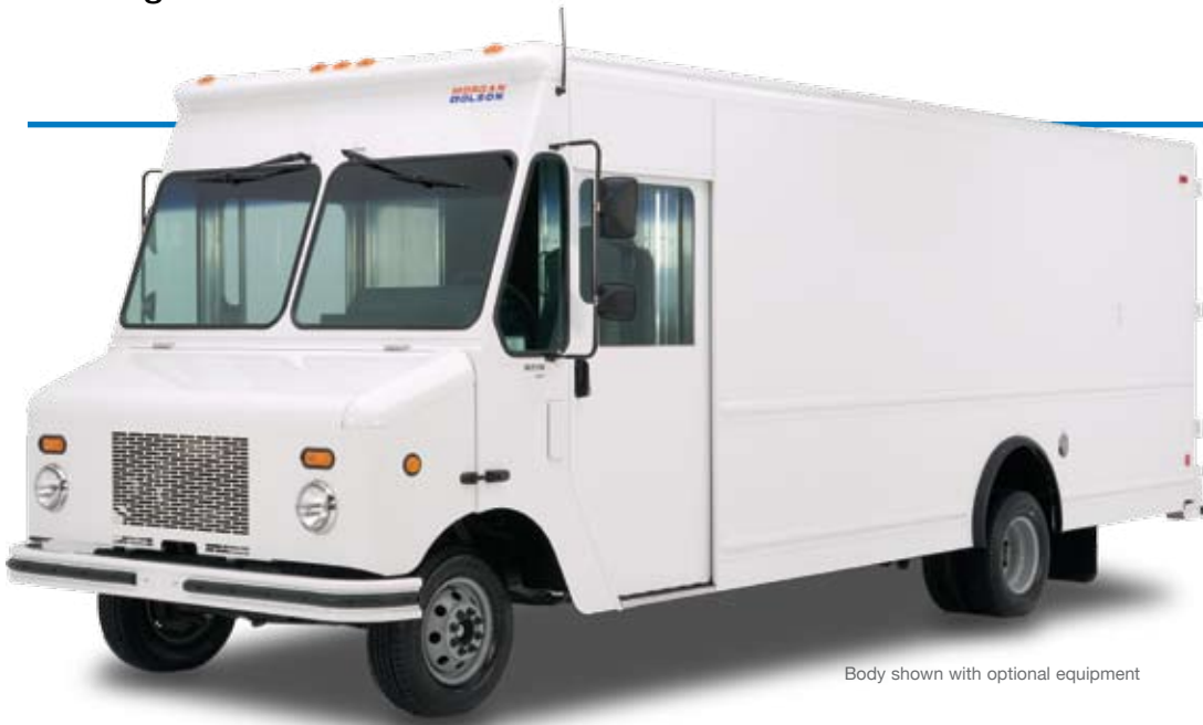
Body shown with optional equipment