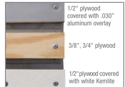
Cargo sidewall liner options

At Morgan Olson, our quest for quality and safety is ongoing and therefore the specifications on the product described herein may vary over time. Please contact us or your local Morgan Olson dealer for the latest product information and available safety features and options.