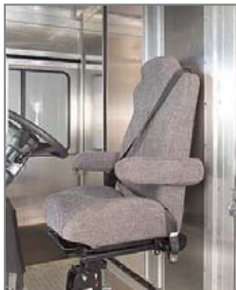
Standard seat with optional armrests