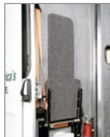
Bulkhead mounted jump seat with optional orange seatbelt