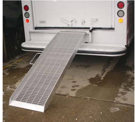
ONE PIECE EXTERIOR FOLD DOWN ALUMINUM RAMP FOR ALL MAKES & MODELS