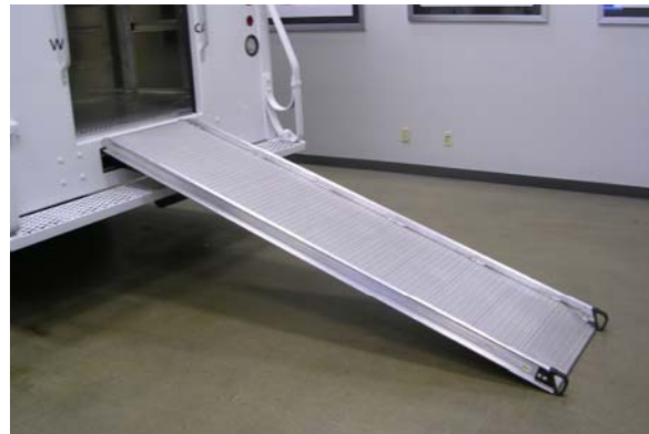
9'L PULL OUT RAMP – FREIGHTLINER ONLY