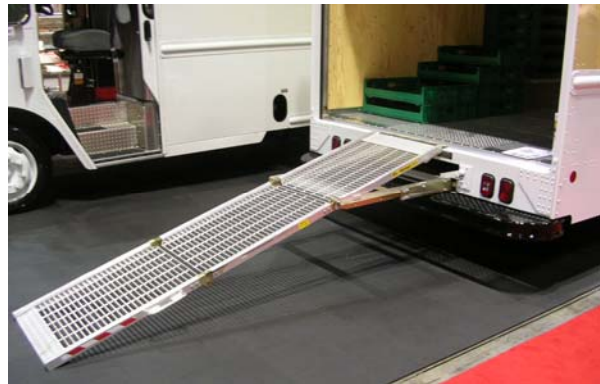
PULL OUT TRI-FOLDING RAMP –WORKHORSE & FORD