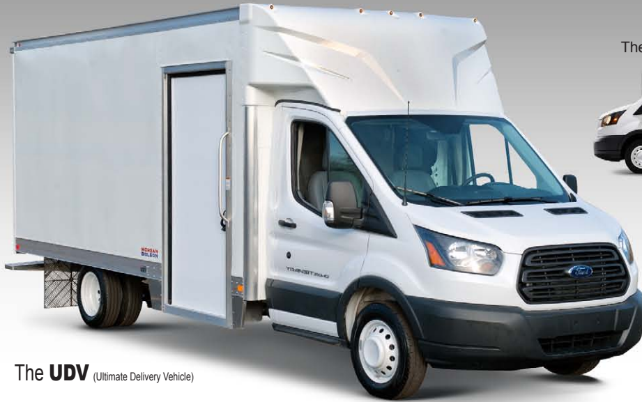
The UDV (Ultimate Delivery Vehicle)