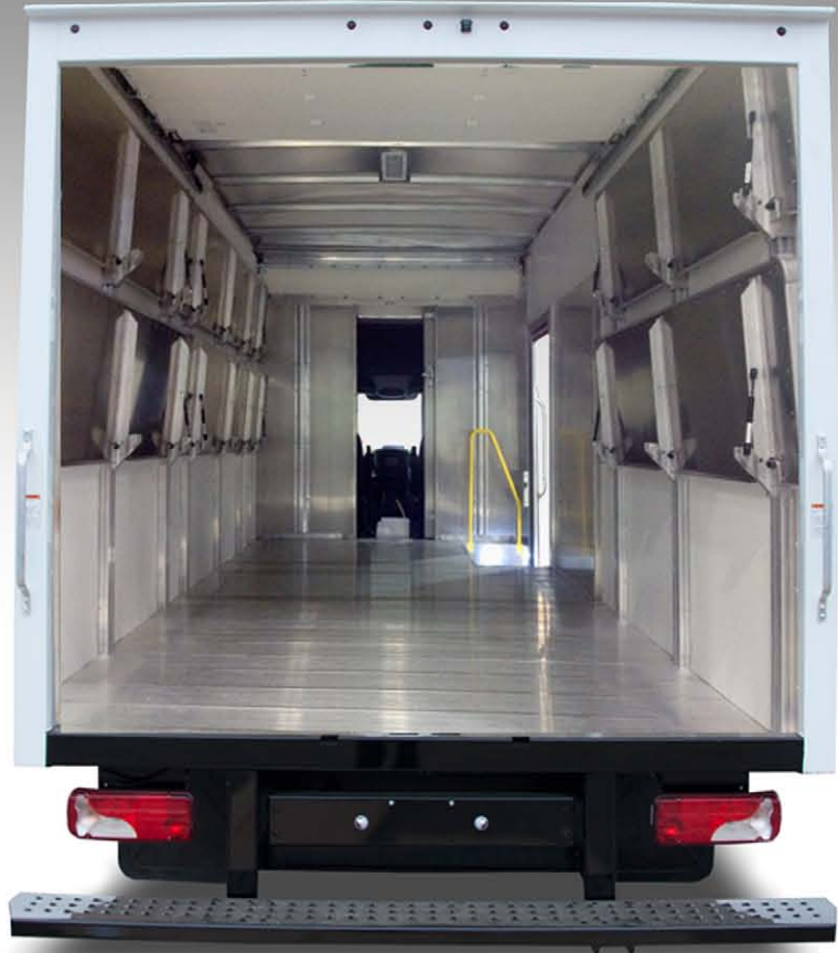
This cargo configuration features our durable all-aluminum floor with composite interior lining and Morgan Olson's patented infinitely adjustable sidewall shelving stiffeners. Custom Cargo Configurations Available.

Morgan Olson's legacy of building the most durable and safest Walk-In vans now comes in a smaller package...the UDV is a great fit for smaller routes wanting increased fuel efficiency.