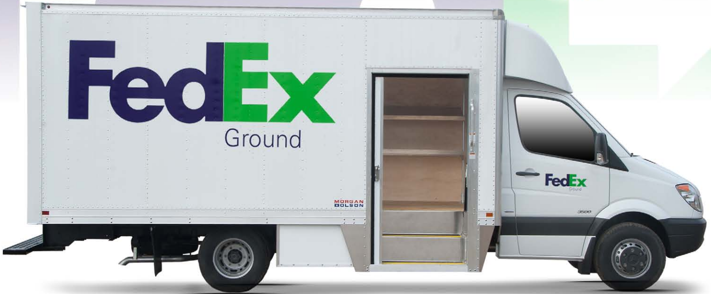
The UDV ( Ultimate Delivery Vehicle )