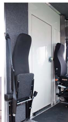
Durable "cab/cargo" access door.