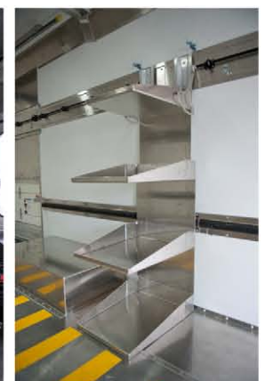
Cargo area designed to your exact specifications