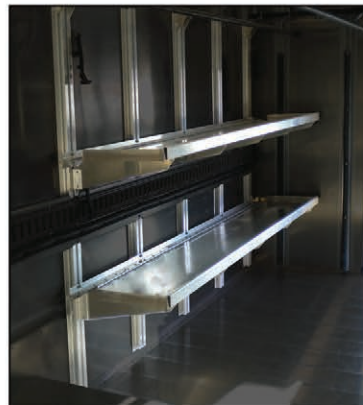
Folding Aluminum Shelves with Adjustable Stiffeners