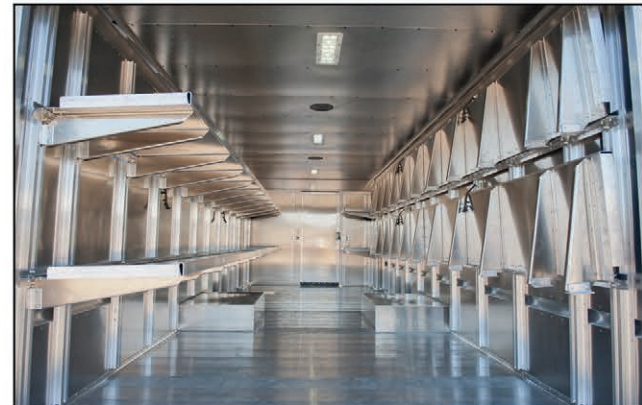
Our Most Popular Package Delivery Folding Shelves Option