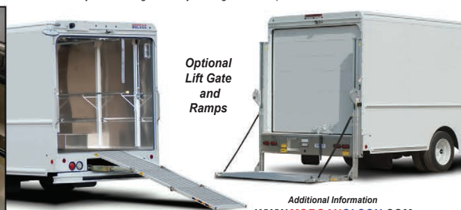
Optional Lift Gate and Ramps

Additional Information WWW.MORGANOLSON.COM