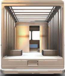
Full Translucent Roof