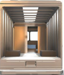
Center Skylight Roof