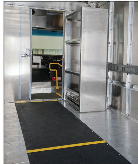
Safety Tread & Safety Entrance Handrail with 3-tier bookcase style shelving