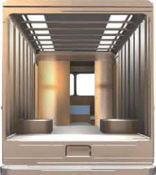
Twin Skylight Roof