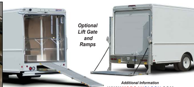
Optional Lift Gate and Ramps

Additional Information WWW.MORGANOLSON.COM