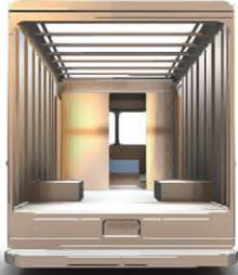
Full Translucent Roof