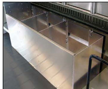
Storage Bins with E-Track