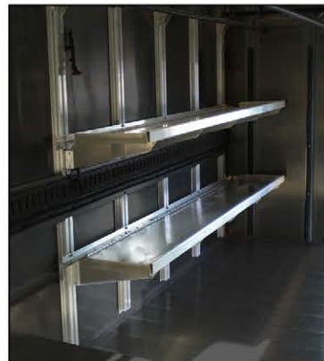
Folding Aluminum Shelves with Adjustable Stiffeners