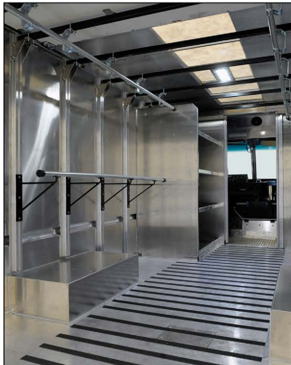
Safety non-slip floor with Twin Uniform Hangers and convenient 4-tier storage shelves ML004, Rev 20B