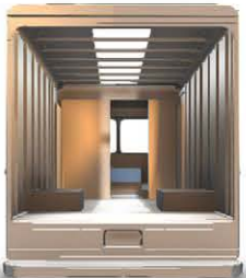
Center Skylight Roof