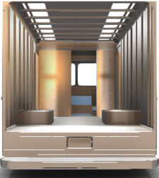
Twin Skylight Roof