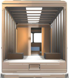
Center Skylight Roof