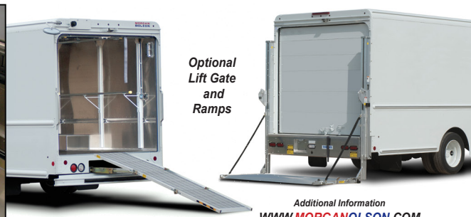
Optional Lift Gate and Ramps

Additional Information WWW.MORGANOLSON.COM