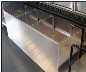
Storage Bins with E-Track