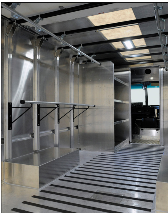
Safety non-slip floor with Twin Uniform Hangers and convenient 4-tier storage shelves