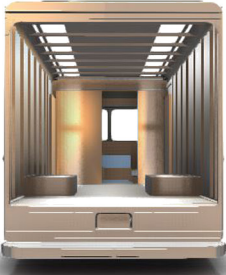
Twin Skylight Roof