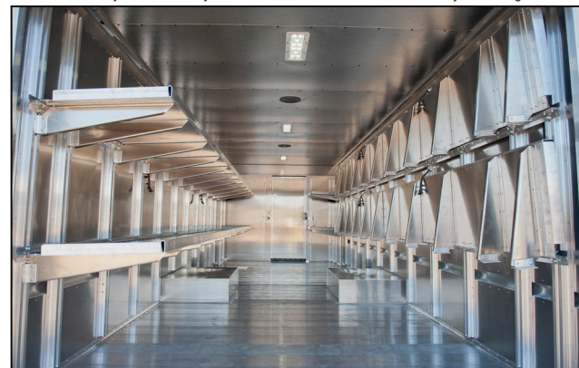
Our Most Popular Package Delivery Folding Shelves Option