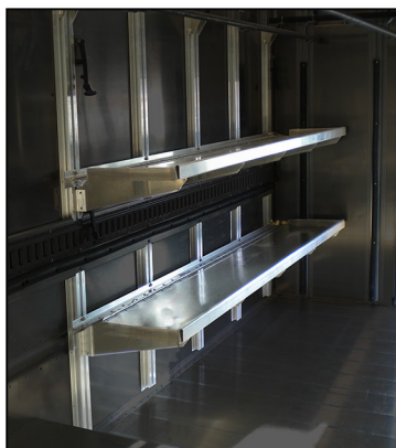
Folding Aluminum Shelves with Adjustable Stiffeners