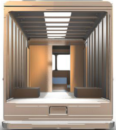
Center Skylight Roof