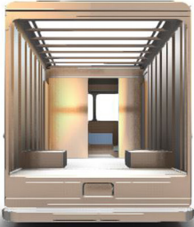
Full Translucent Roof