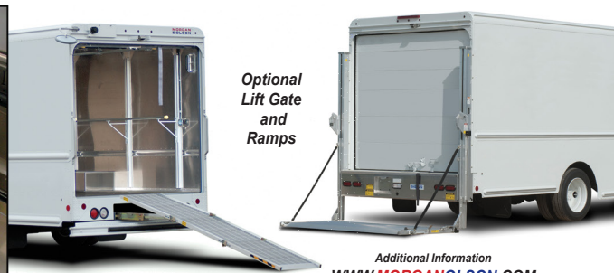
Optional Lift Gate and Ramps

Additional Information WWW.MORGANOLSON.COM