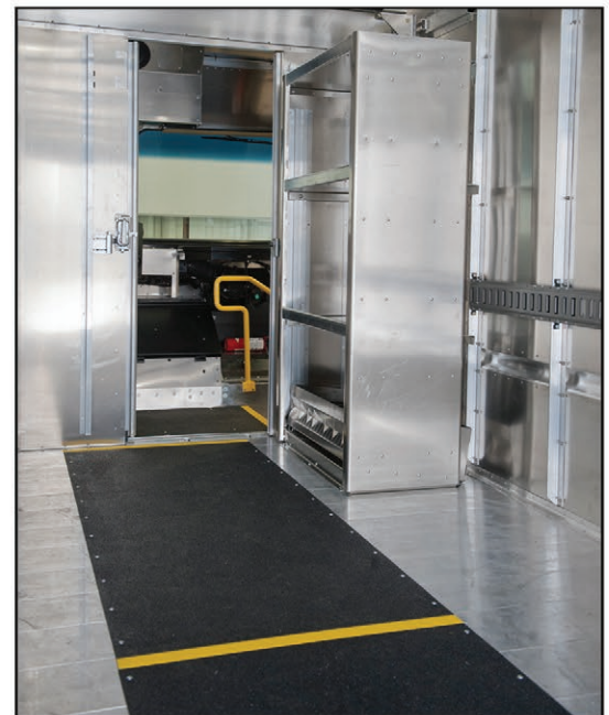
Safety Tread & Safety Entrance Handrail with 3-tier bookcase style shelving