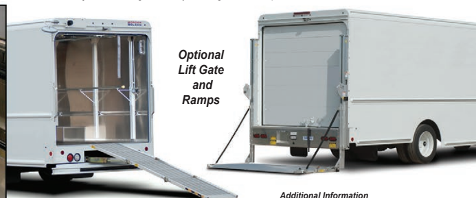
Optional Lift Gate and Ramps

Additional Information WWW.MORGANOLSON.COM