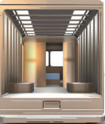
Twin Skylight Roof