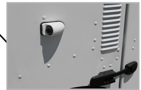
Blind Spot Camera

Shows split screen with blind spot cameras.