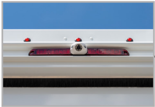
Rear View Camera