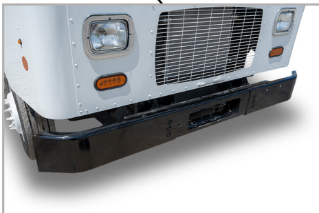
Shock Style Bumper

Four lower and two upper proximity sensors