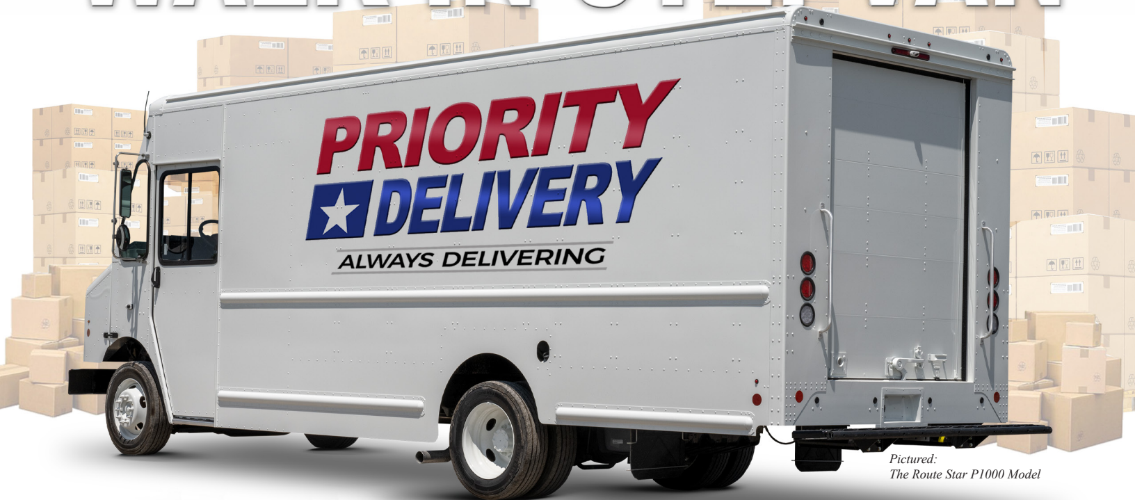
Pictured: The Route Star P1000 Model