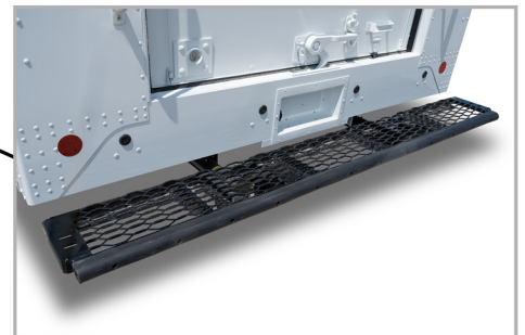
Patented SpringBack Sectional Front Bumper