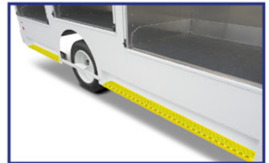
Hi-Visibility Step Rail