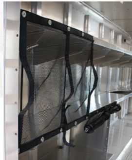
Cargo Restraint Options