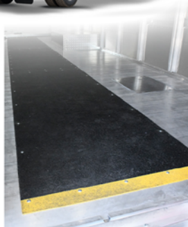
Safety Tread Walkways