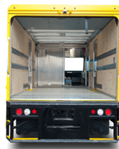
Dock Height Rear Bumper