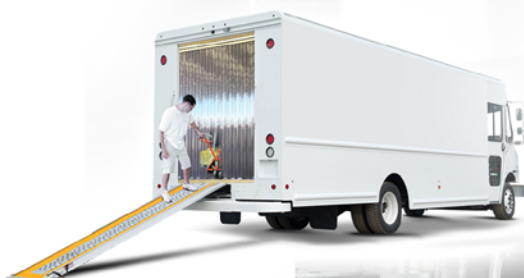
Ramps & Liftgates